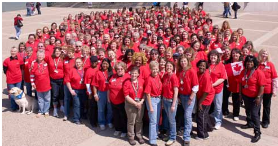
2010 Salute to Women Behind the Wheel, Louisville, KY